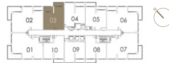
Key Plan : Second Floor