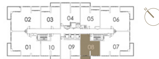
Key Plan : Second Floor