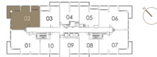
Key Plan : Second Floor