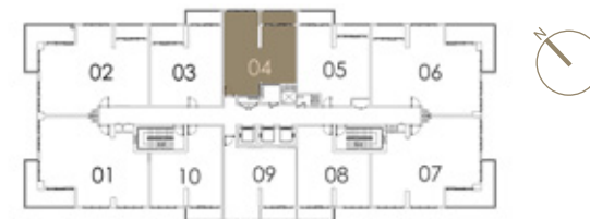
Key Plan : Second Floor