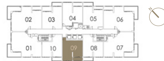
Key Plan : Second Floor