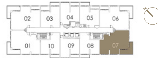
Key Plan : Second Floor