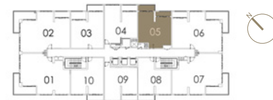
Key Plan : Second Floor