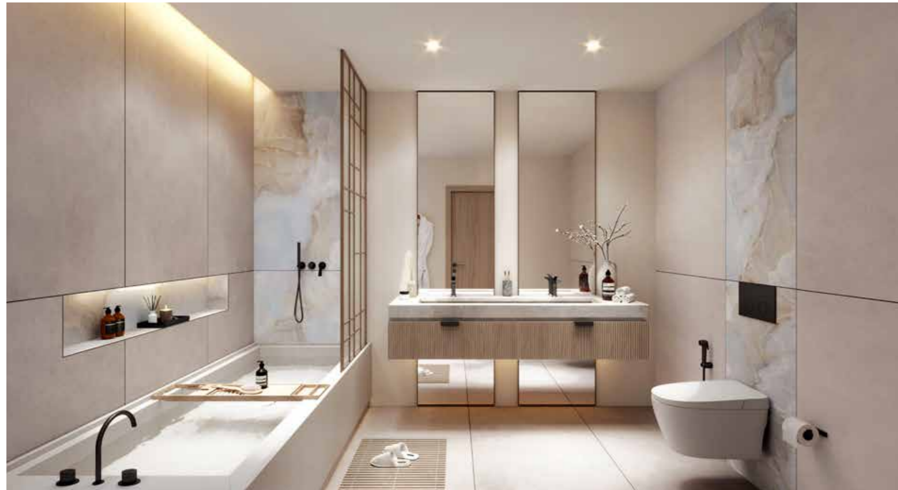
2-BR TYPE 3