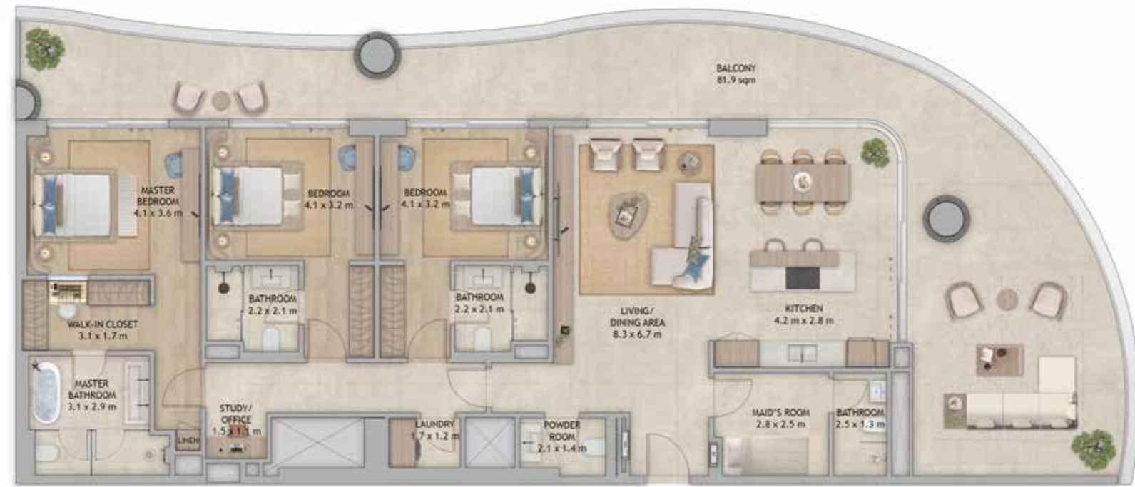
3-BR + MAID TYPE 1