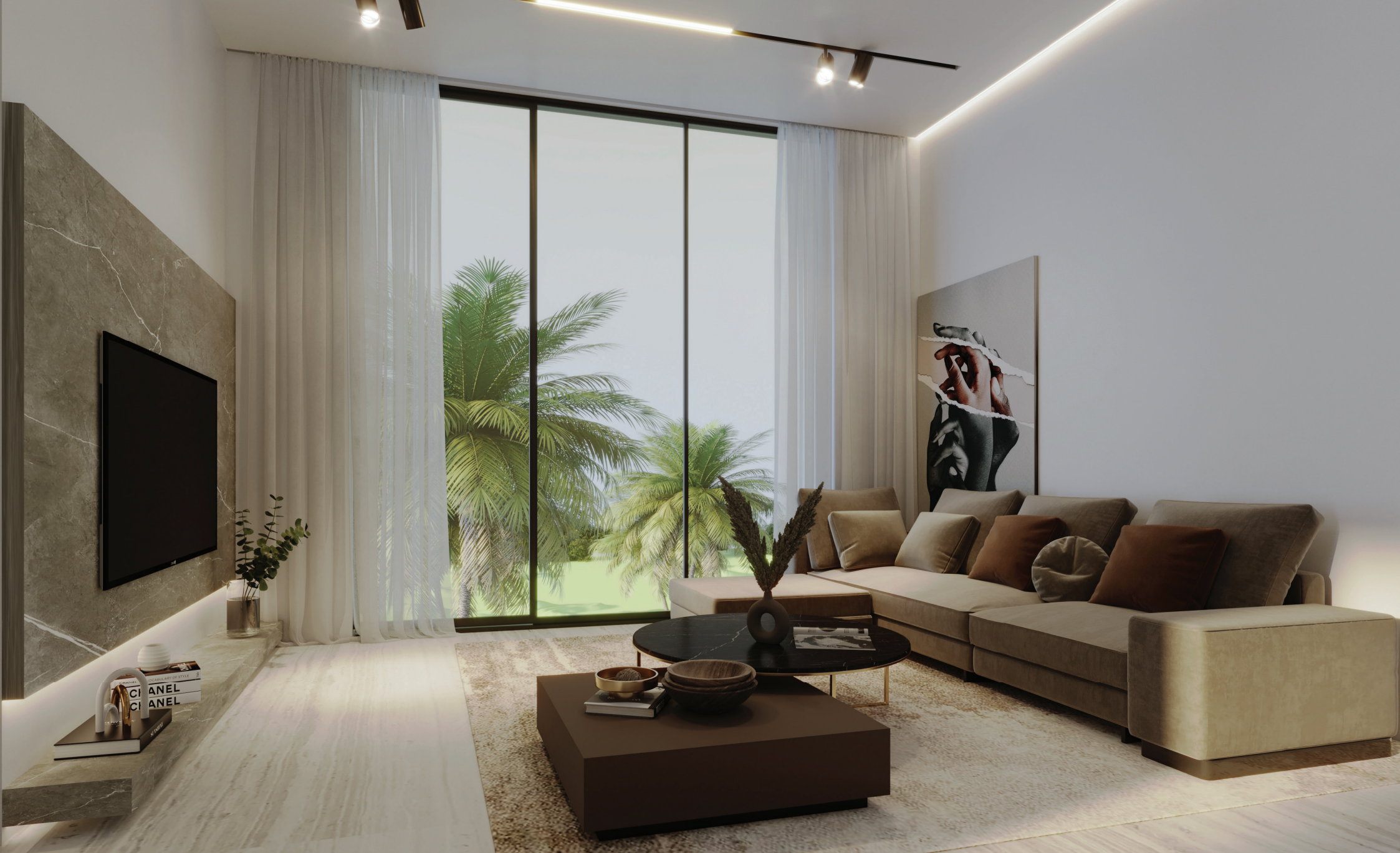
SECOND FLOOR LIVING AREA