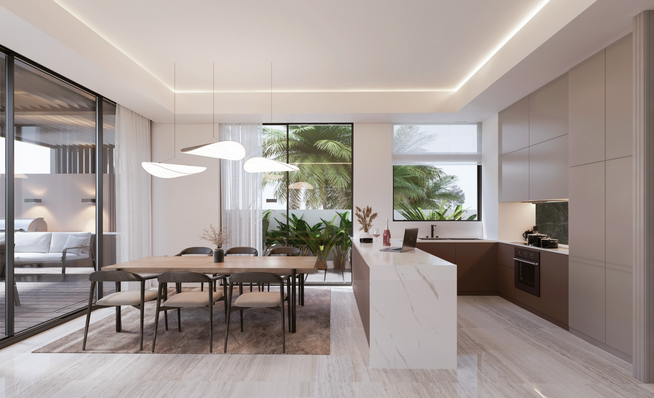
KITCHEN AND DINING