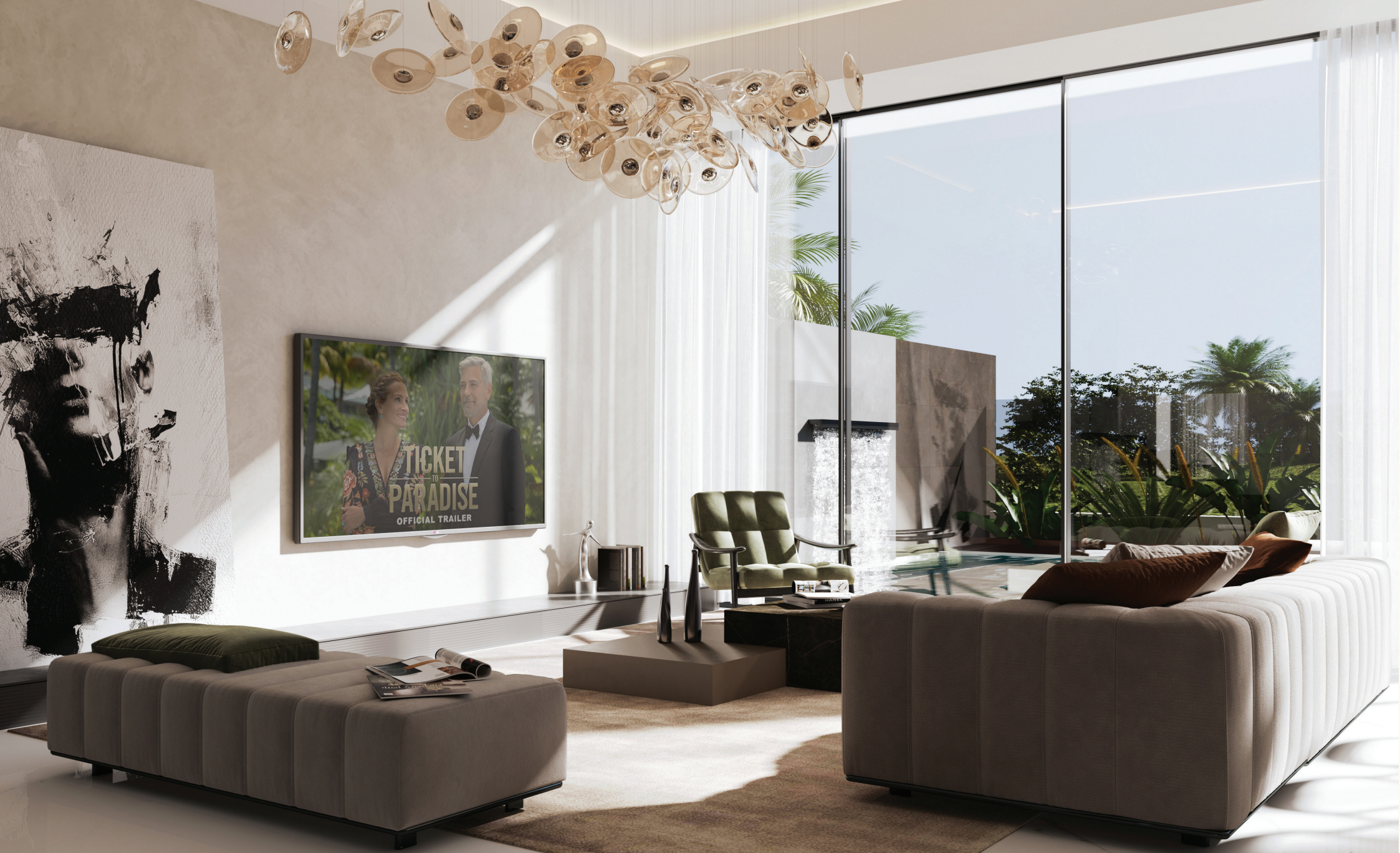
GROUND FLOOR LIVING AREA