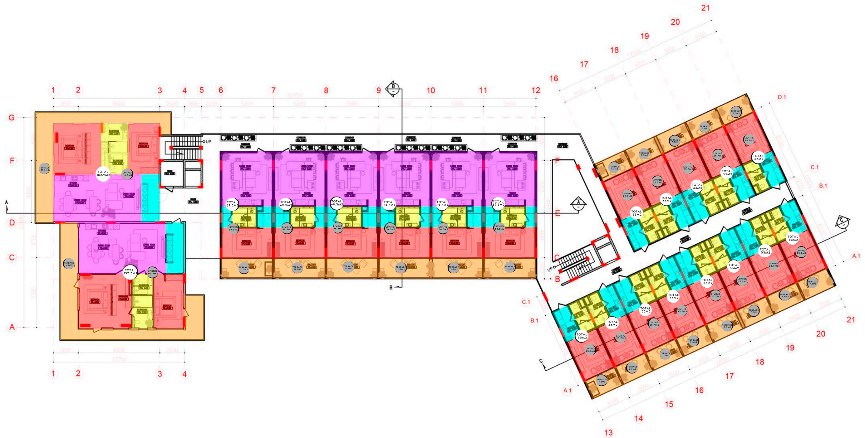
2ND FLOOR PLAN Scale 1 : 250