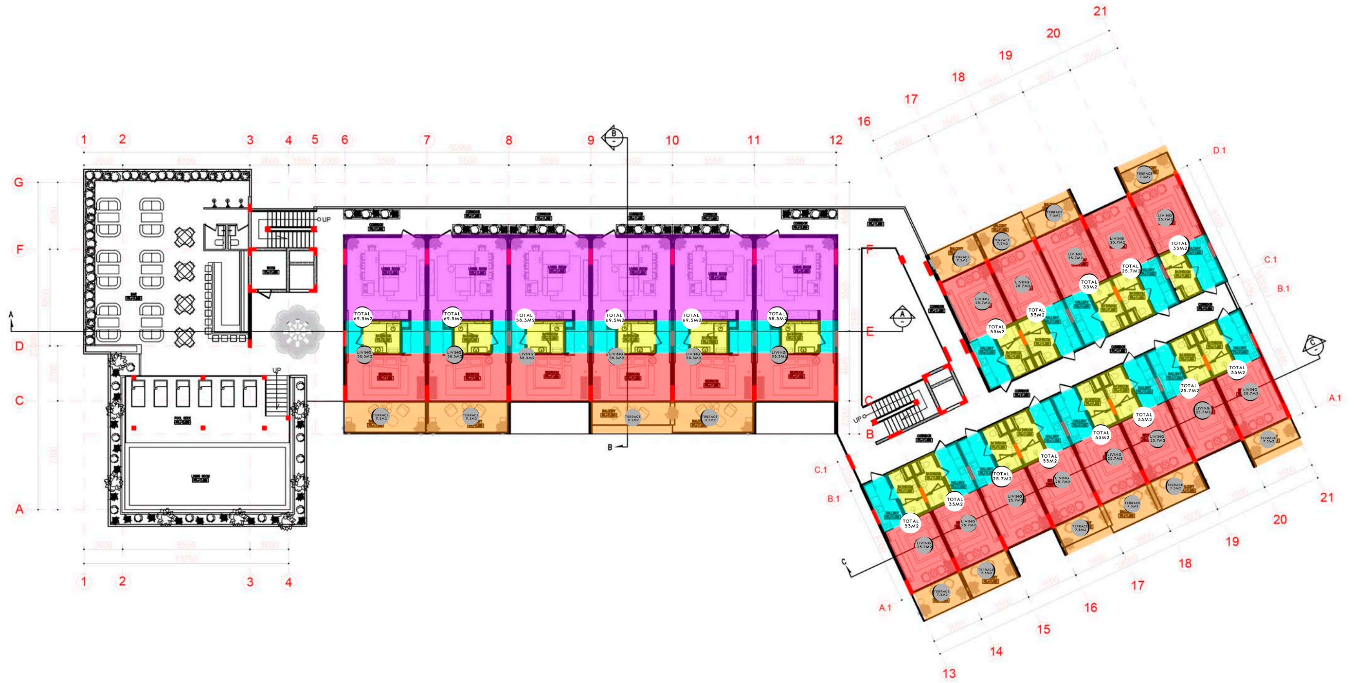
5TH FLOOR PLAN Scale 1 : 250