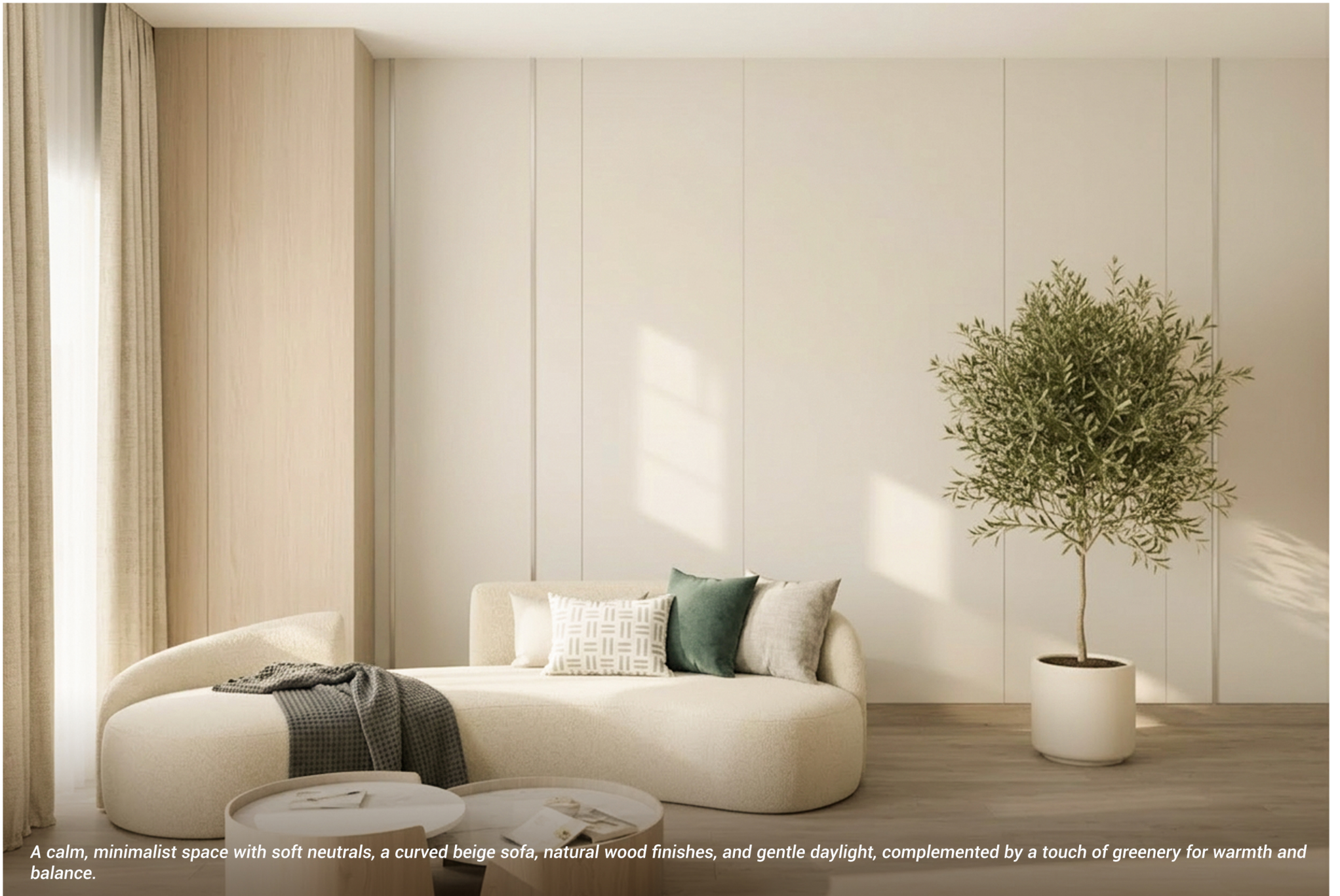
A calm, minimalist space with soft neutrals, a curved beige sofa, natural wood finishes, and gentle daylight, complemented by a touch of greenery for warmth and balance.