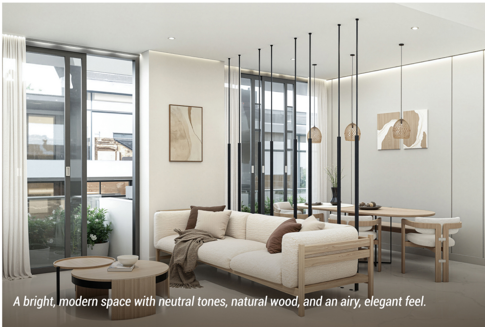
A bright, modern space with neutral tones, natural wood, and an airy, elegant feel.