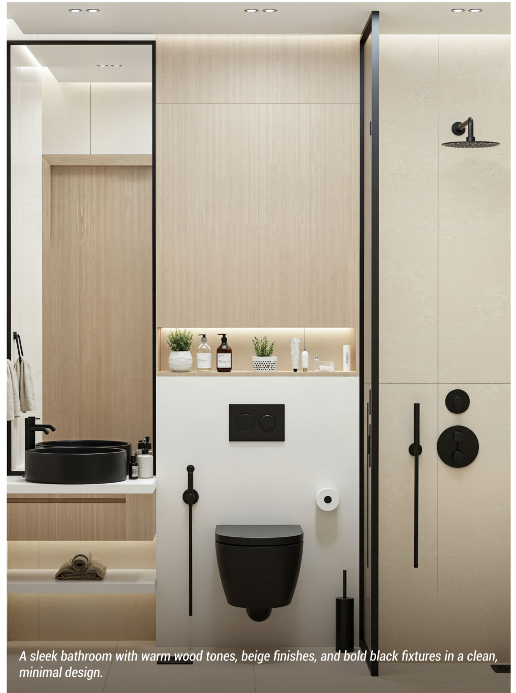
A sleek bathroom with warm wood tones, beige finishes, and bold black fixtures in a clean, minimal design.