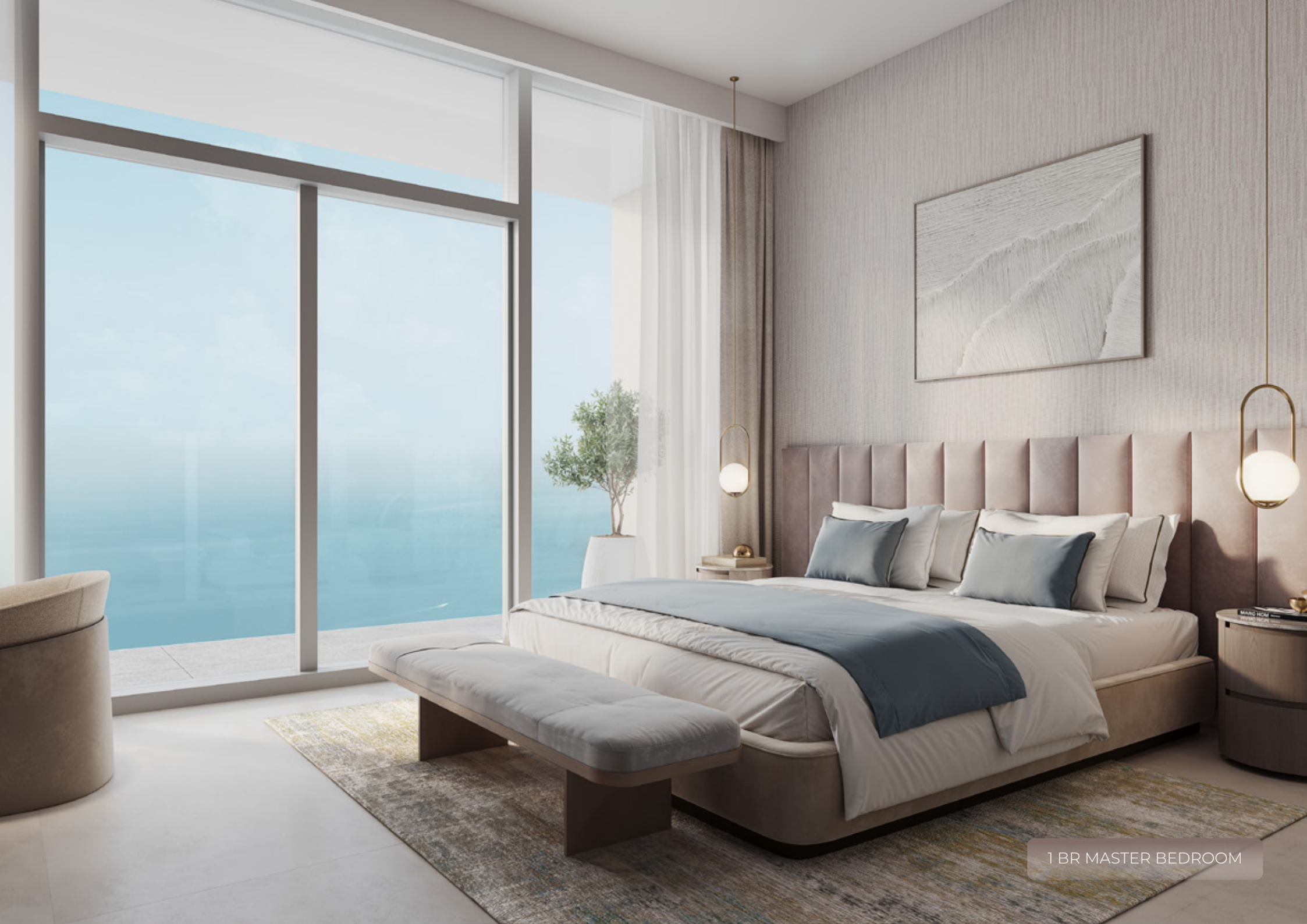
1 BR MASTER BEDROOM