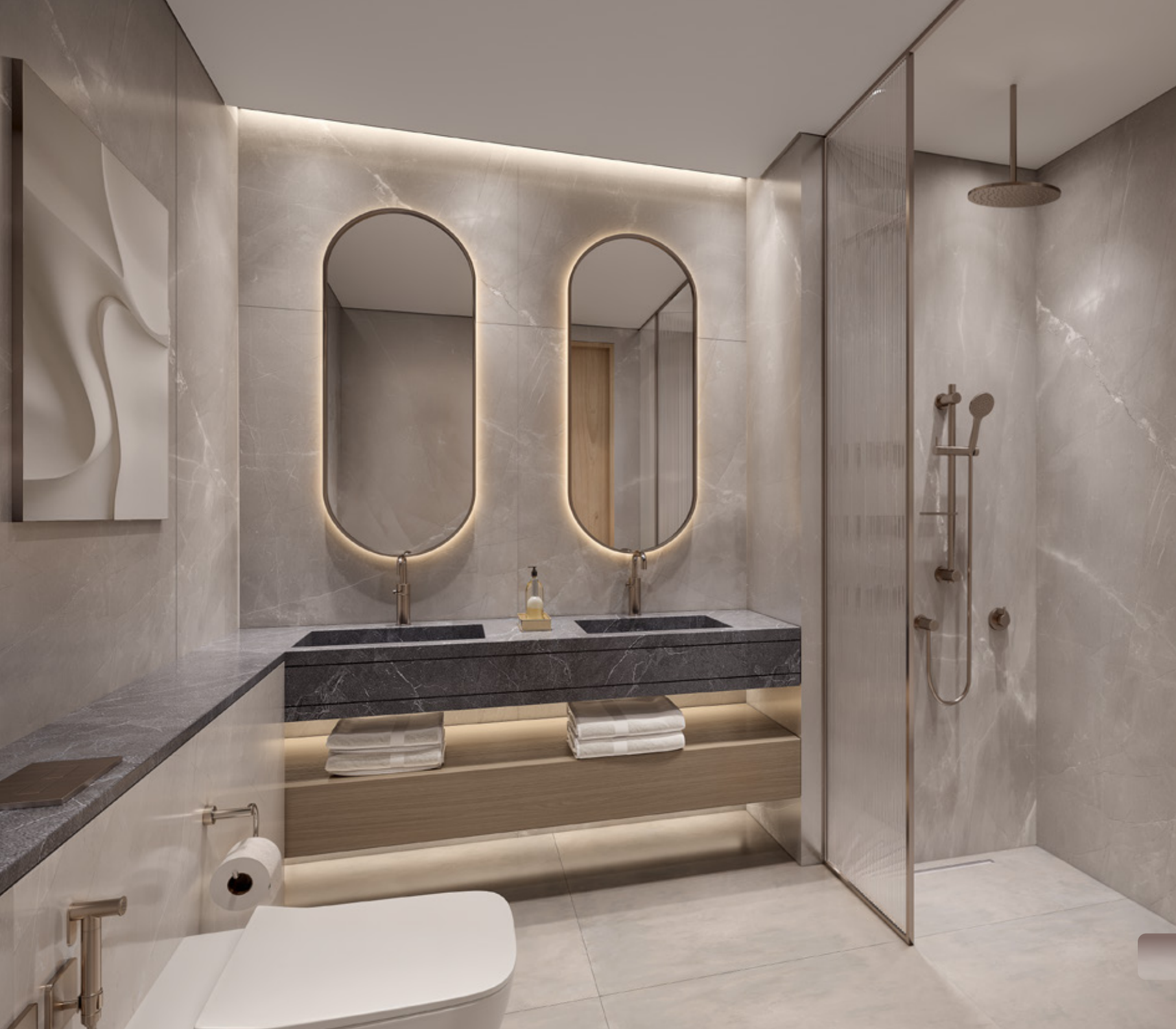
1 BR BATHROOM