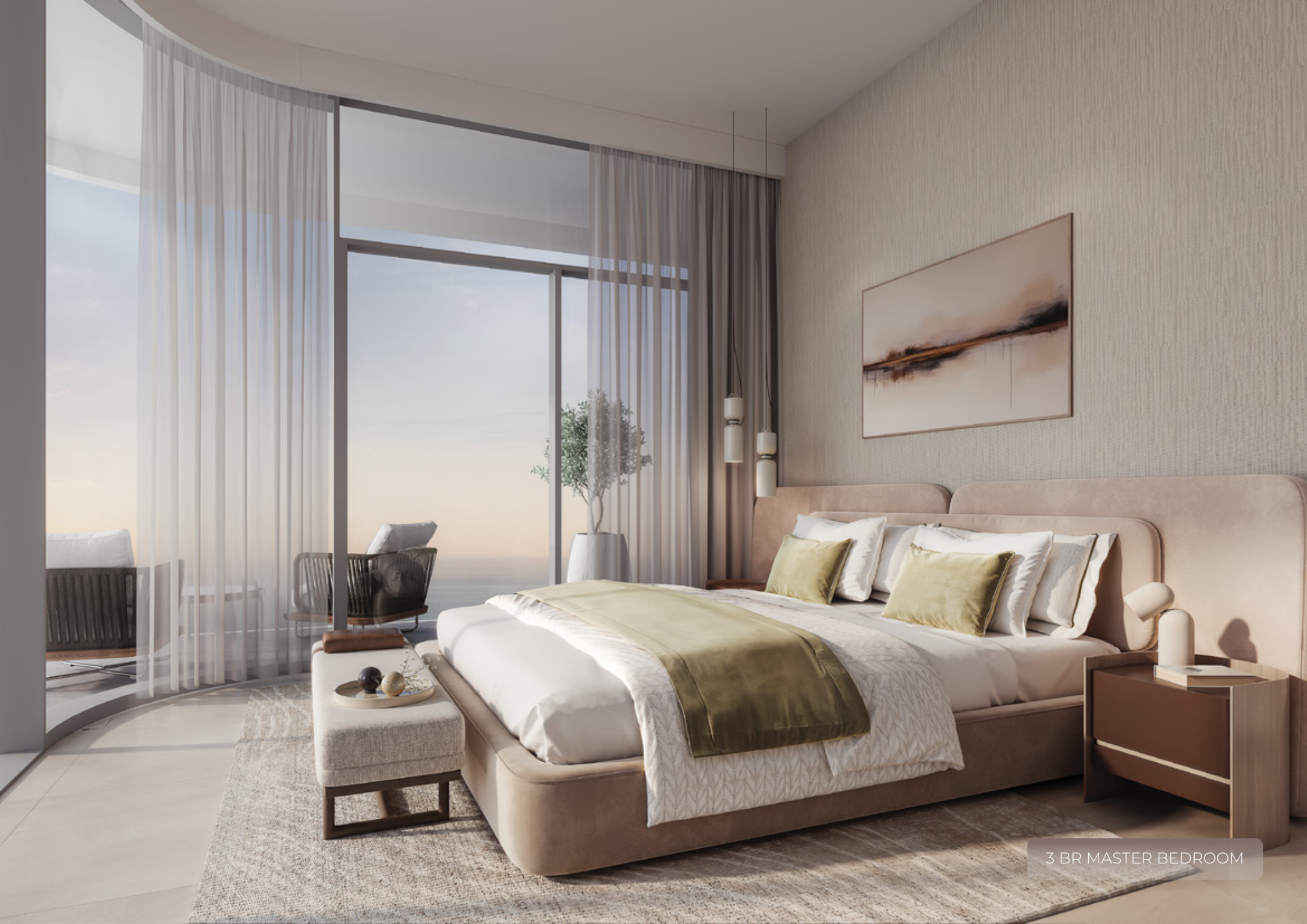
3 BR MASTER BEDROOM