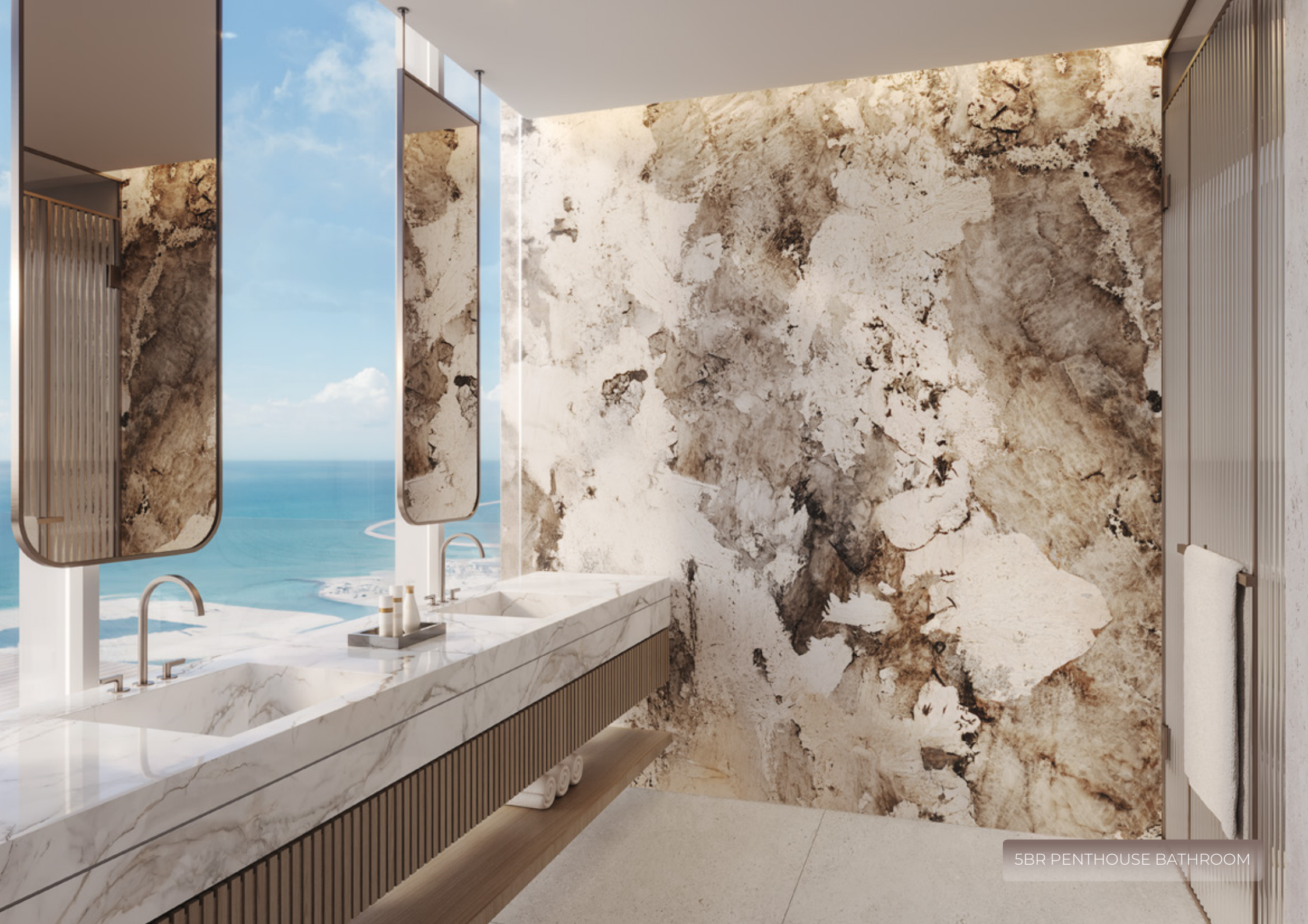
5BR PENTHOUSE BATHROOM