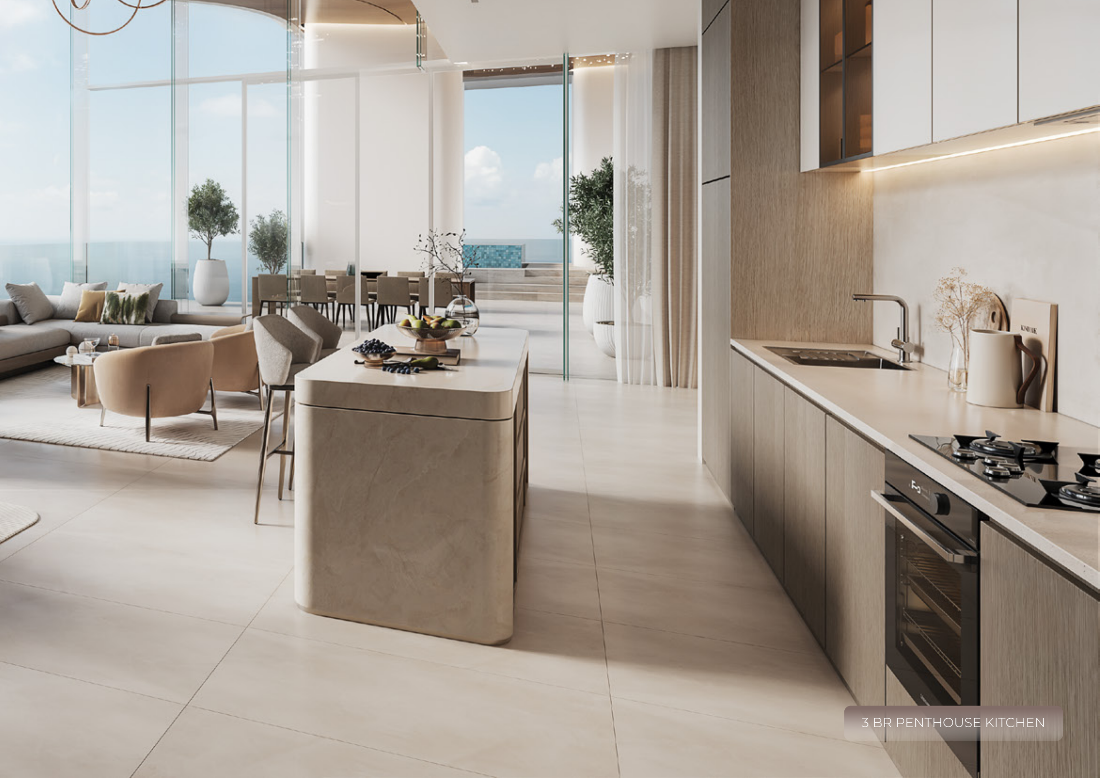
3 BR PENTHOUSE KITCHEN