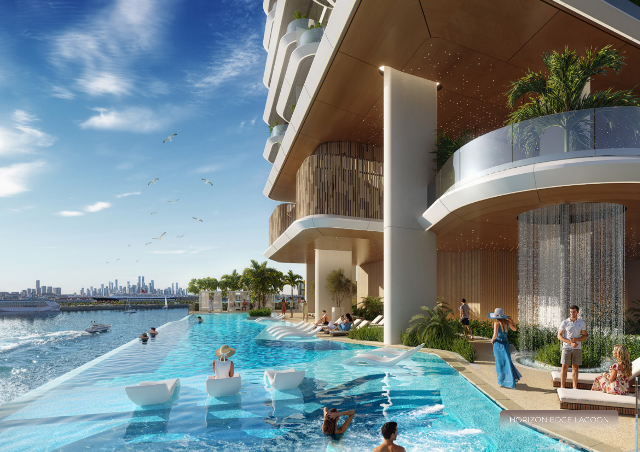
HORIZON EDGE LAGOON