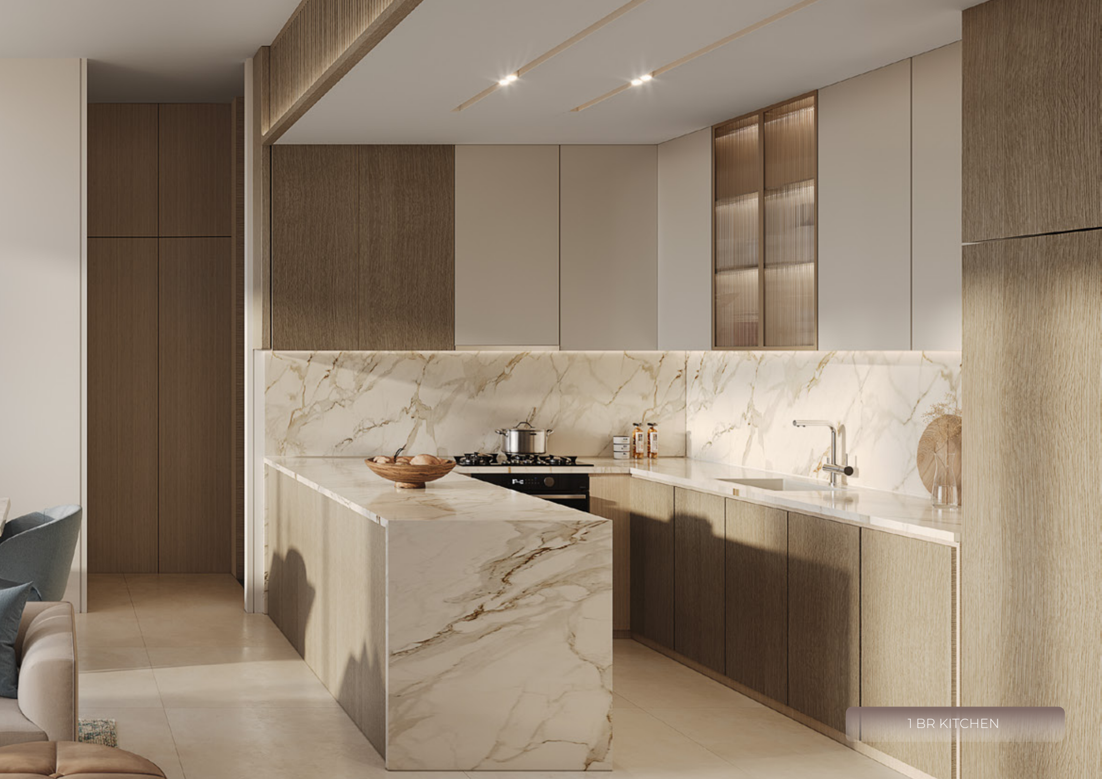
1 BR KITCHEN