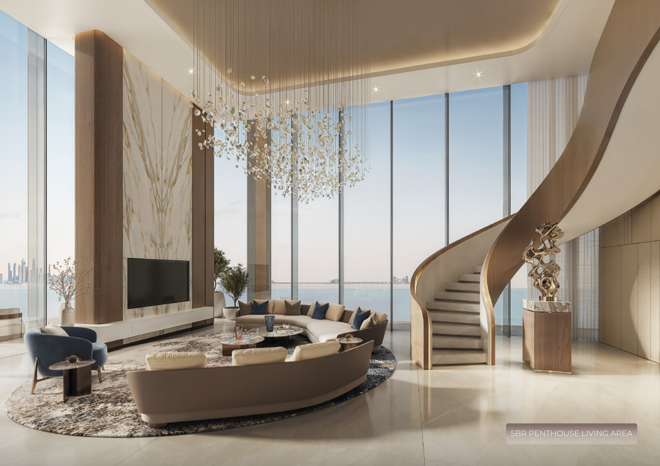
5BR PENTHOUSE LIVING AREA