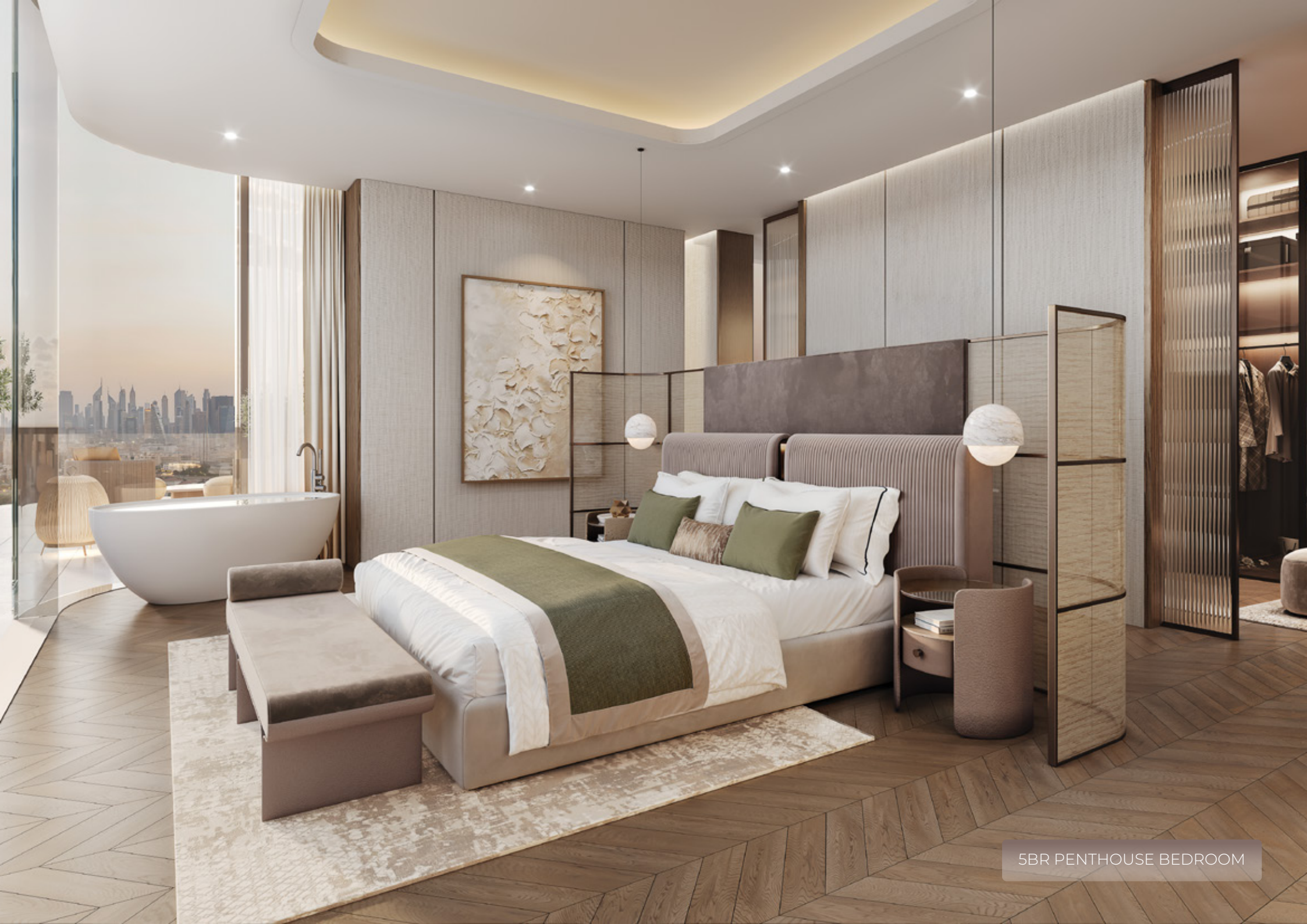
5BR PENTHOUSE BEDROOM