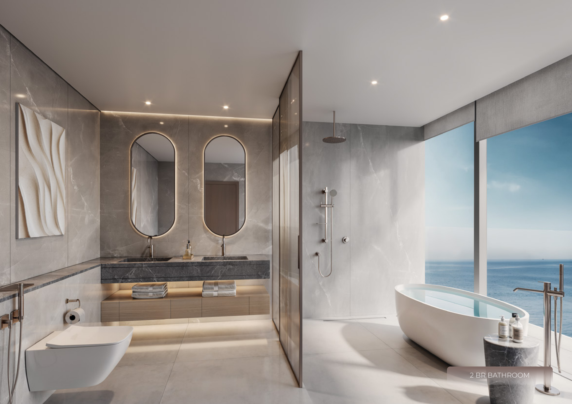
2 BR BATHROOM