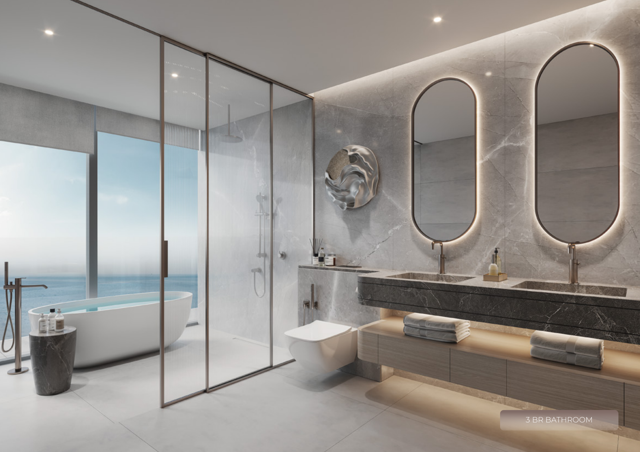
3 BR BATHROOM