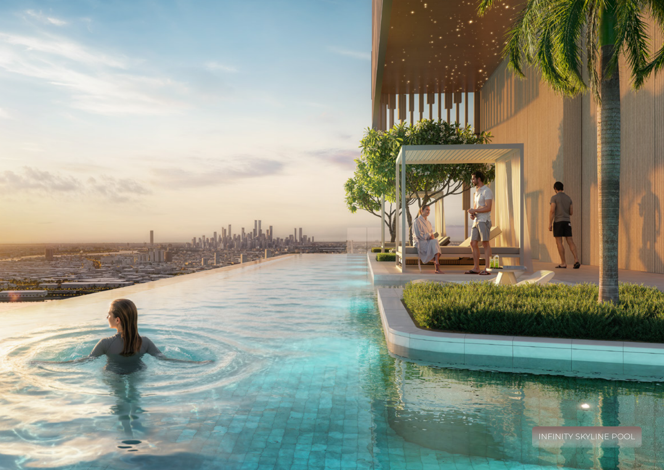
INFINITY SKYLINE POOL