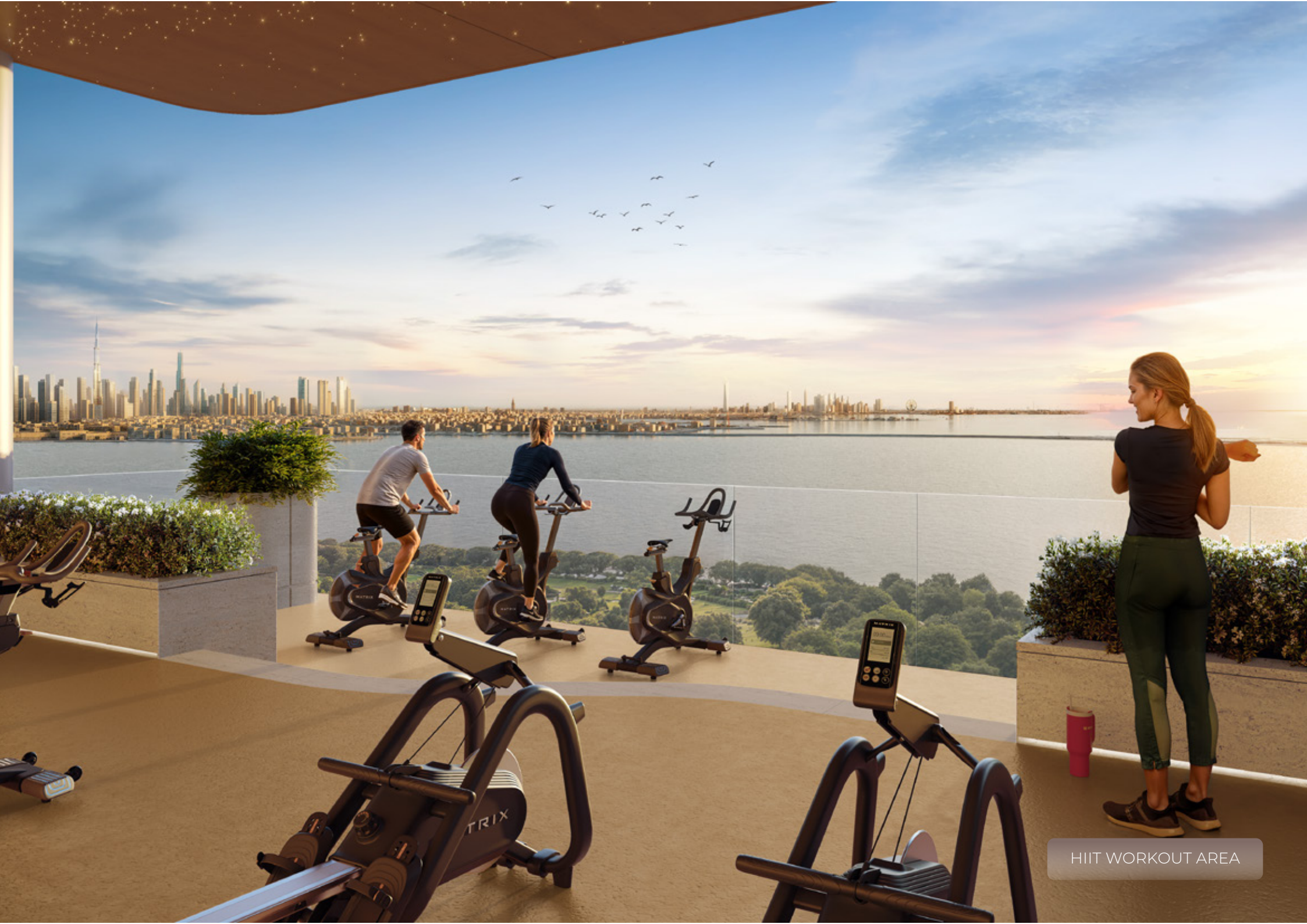
HIIT WORKOUT AREA