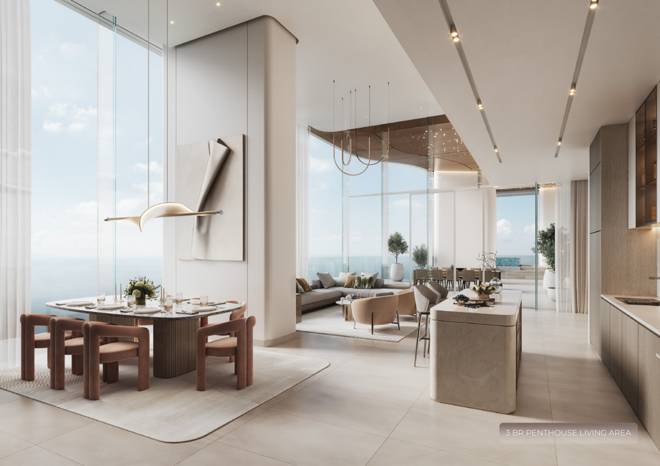
3 BR PENTHOUSE LIVING AREA