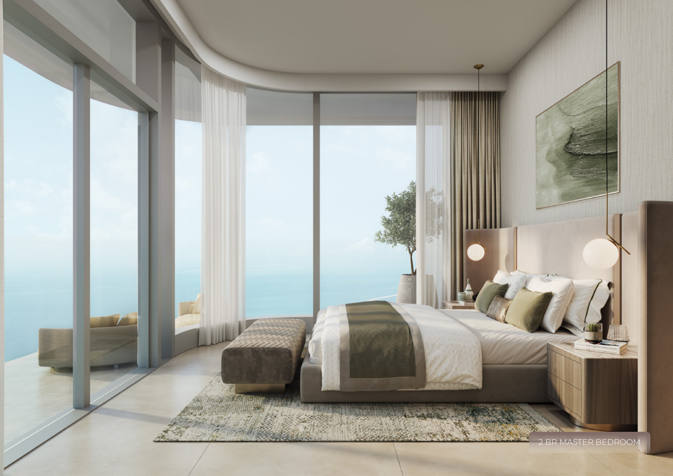
2 BR MASTER BEDROOM