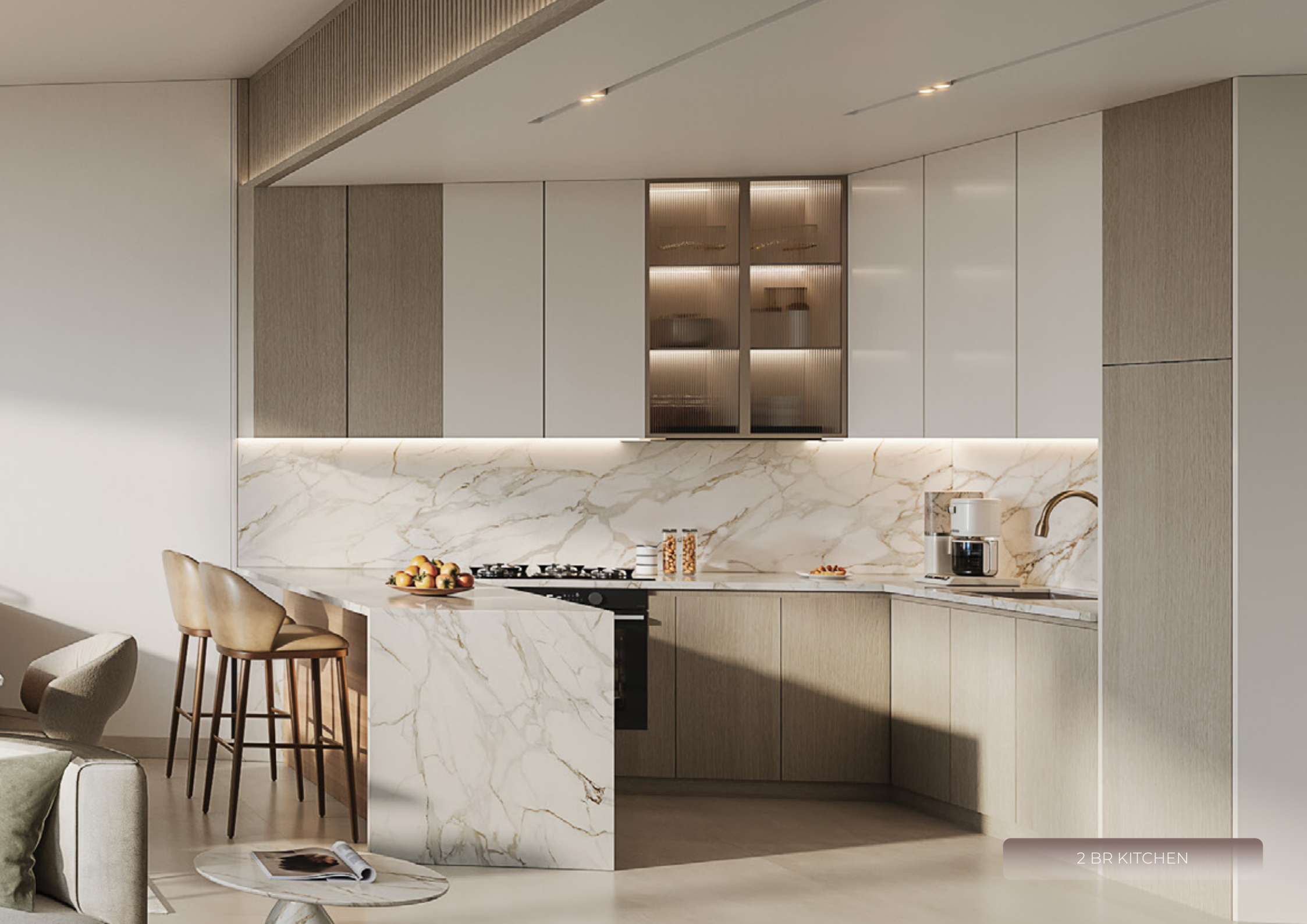
2 BR KITCHEN