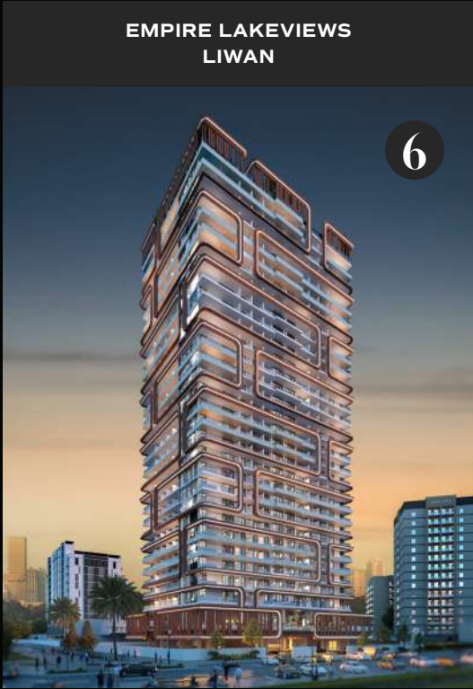
EMPIRE LAKEVIEWS LIWAN