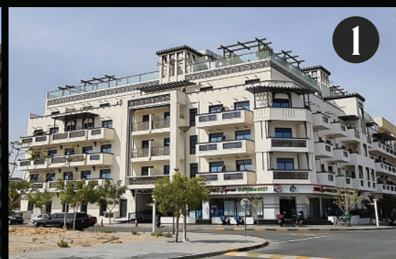
PLAZZO RESIDENCE JUMEIRAH VILLAGE TRIANGLE