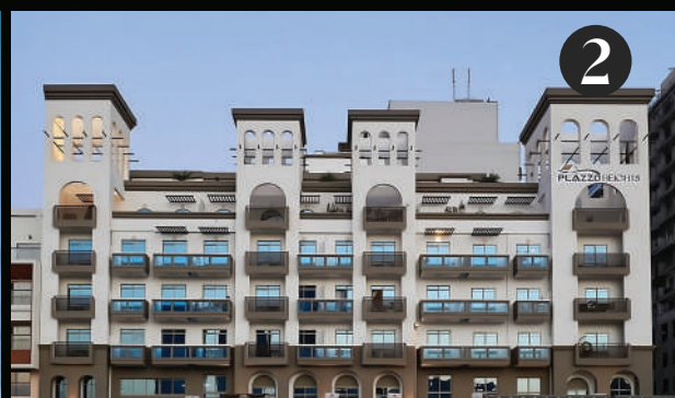
PLAZZO HEIGHTS JUMEIRAH VILLAGE CIRCLE