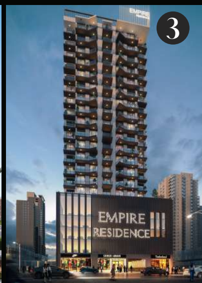
EMPIRE RESIDENCE JUMEIRAH VILLAGE CIRCLE