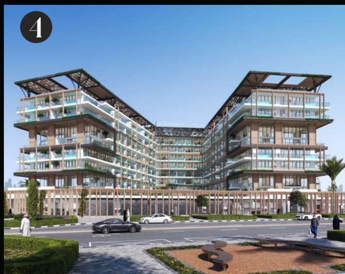
EMPIRE ESTATES ARJAN