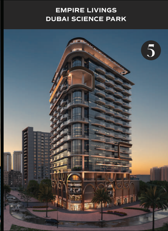
EMPIRE LIVINGS DUBAI SCIENCE PARK