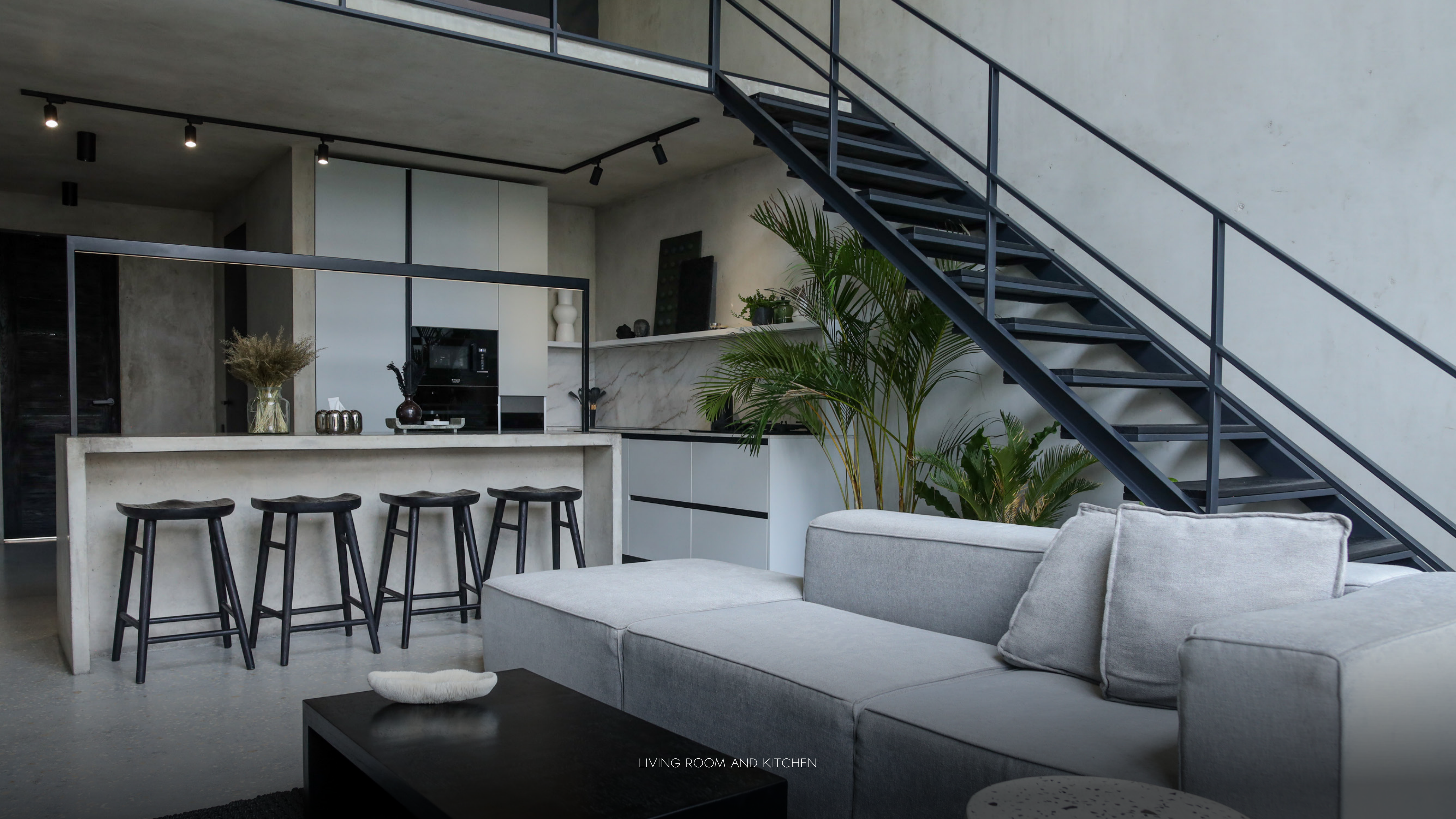
LIVING ROOM AND KITCHEN