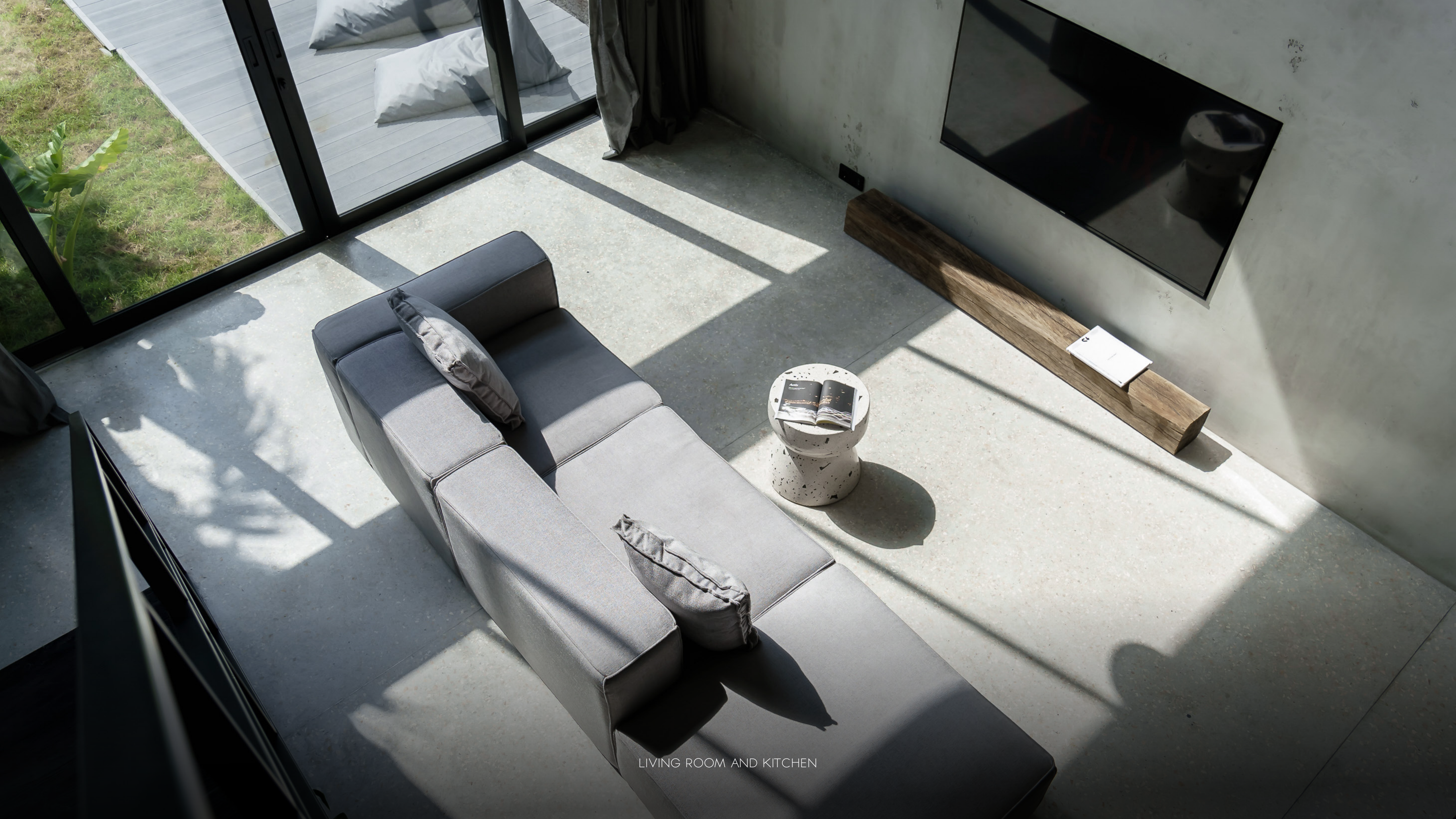
LIVING ROOM AND KITCHEN