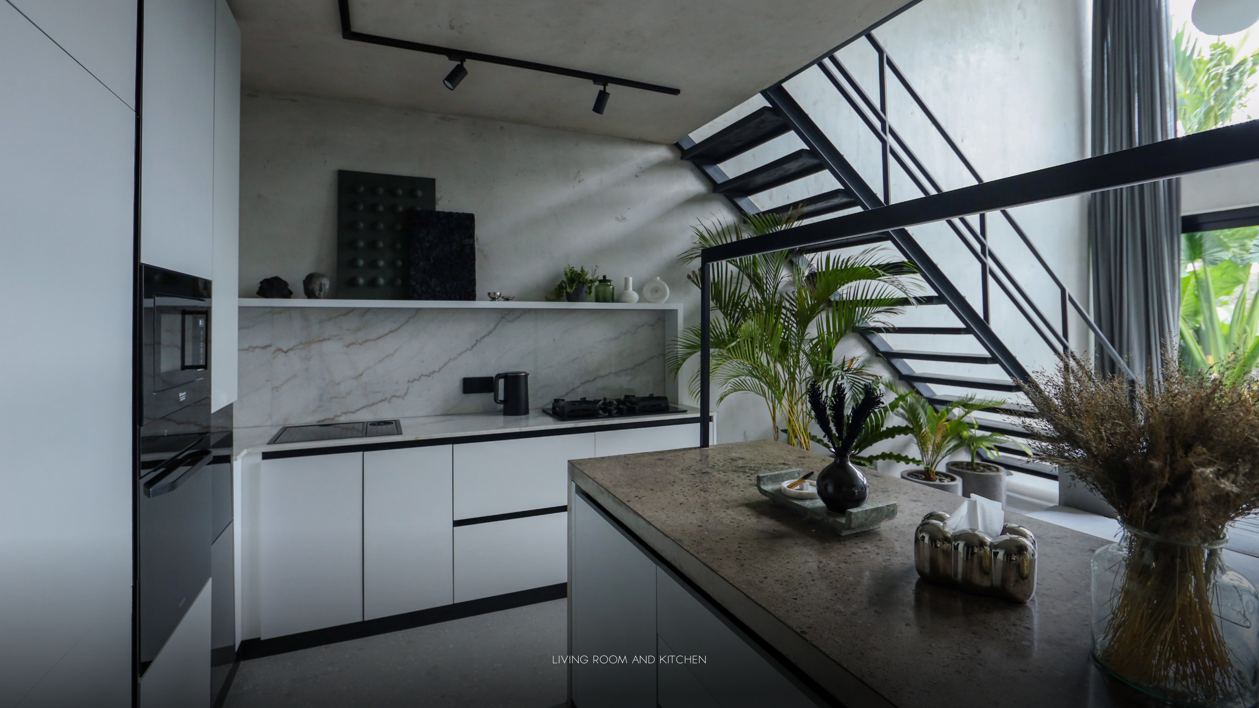
LIVING ROOM AND KITCHEN