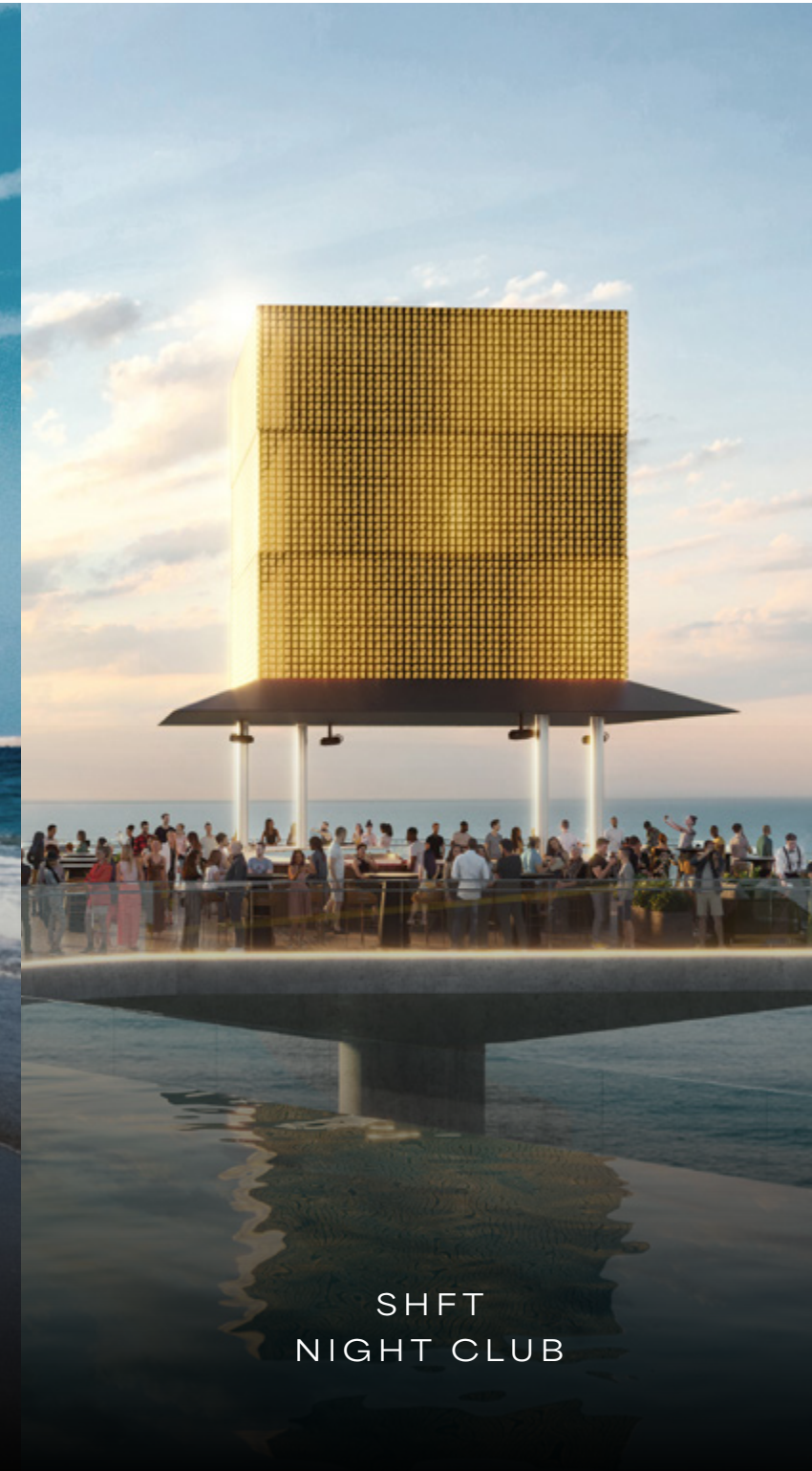
SHFT NIGHT CLUB