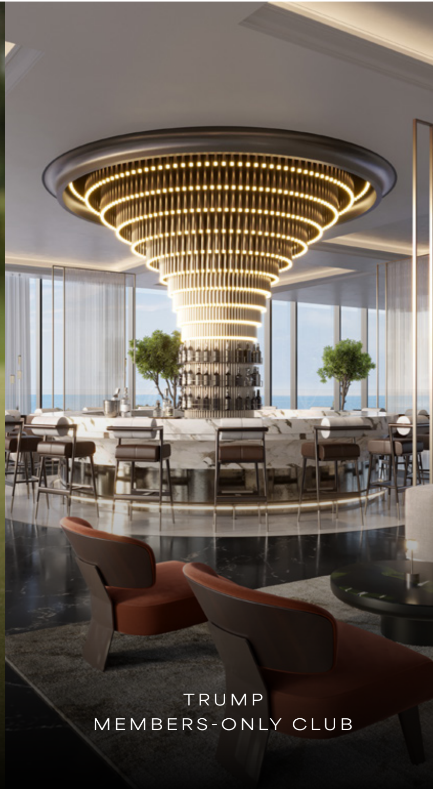
TRUMP MEMBERS-ONLY CLUB