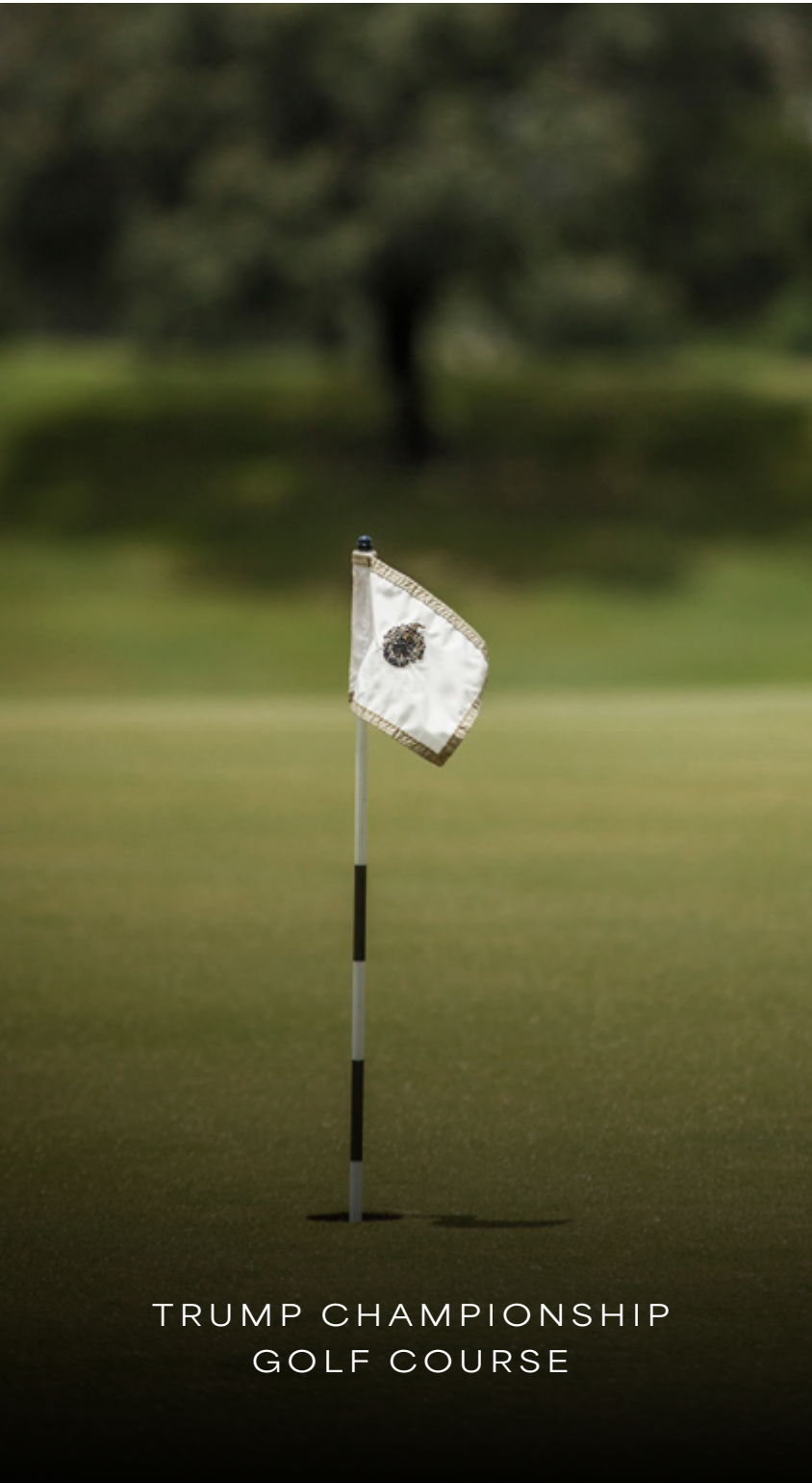
TRUMP CHAMPIONSHIP GOLF COURSE