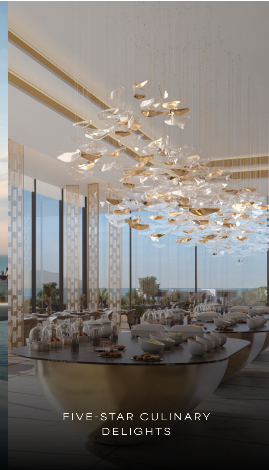
FIVE-STAR CULINARY DELIGHTS