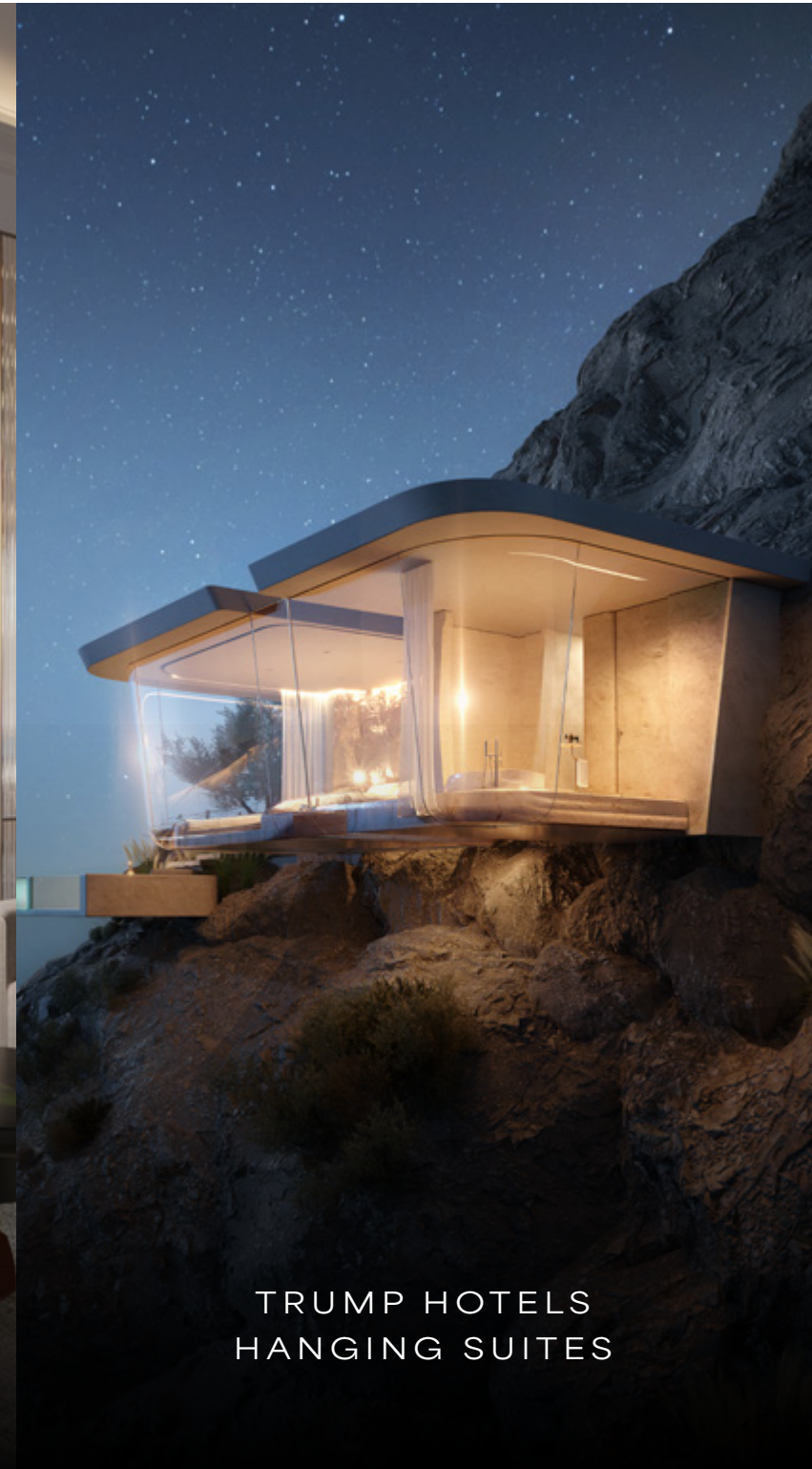
TRUMP HOTELS HANGING SUITES