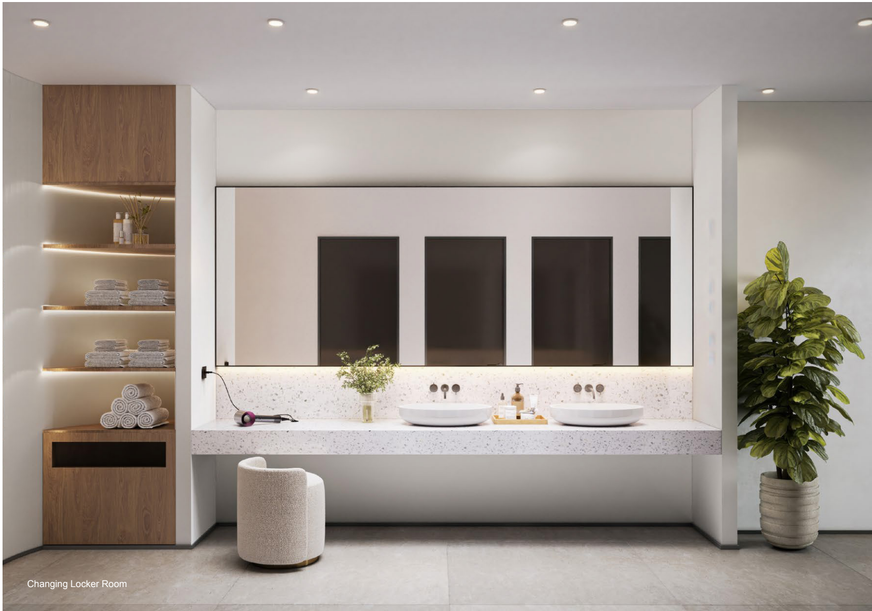
Changing Locker Room