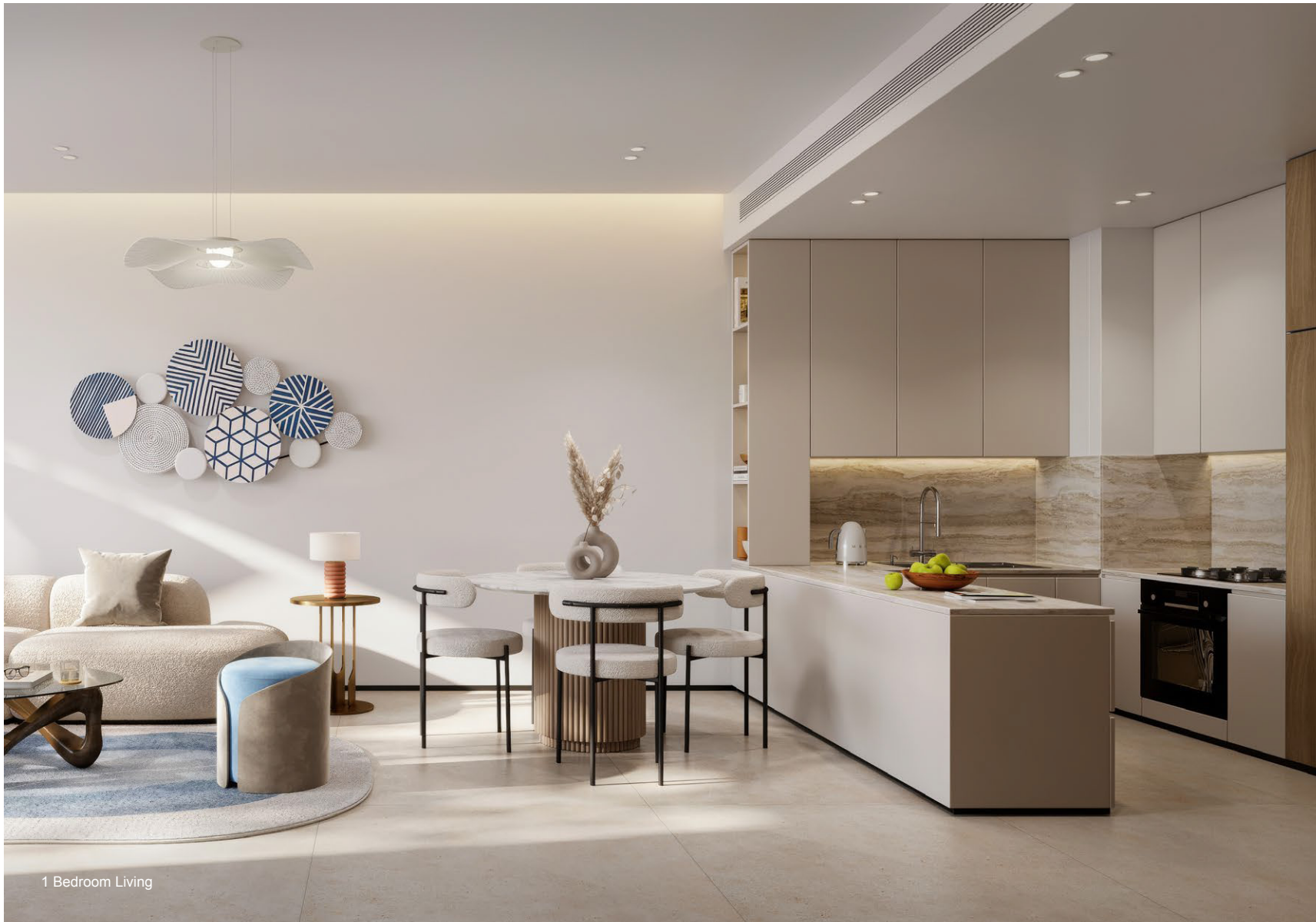
1 Bedroom Living