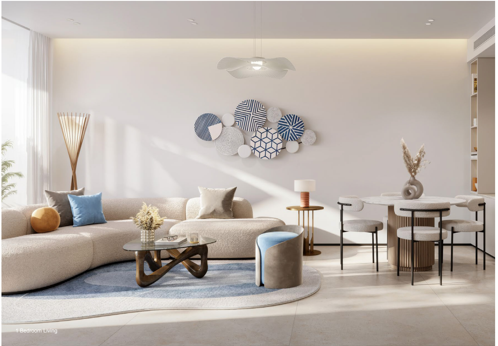
1 Bedroom Living