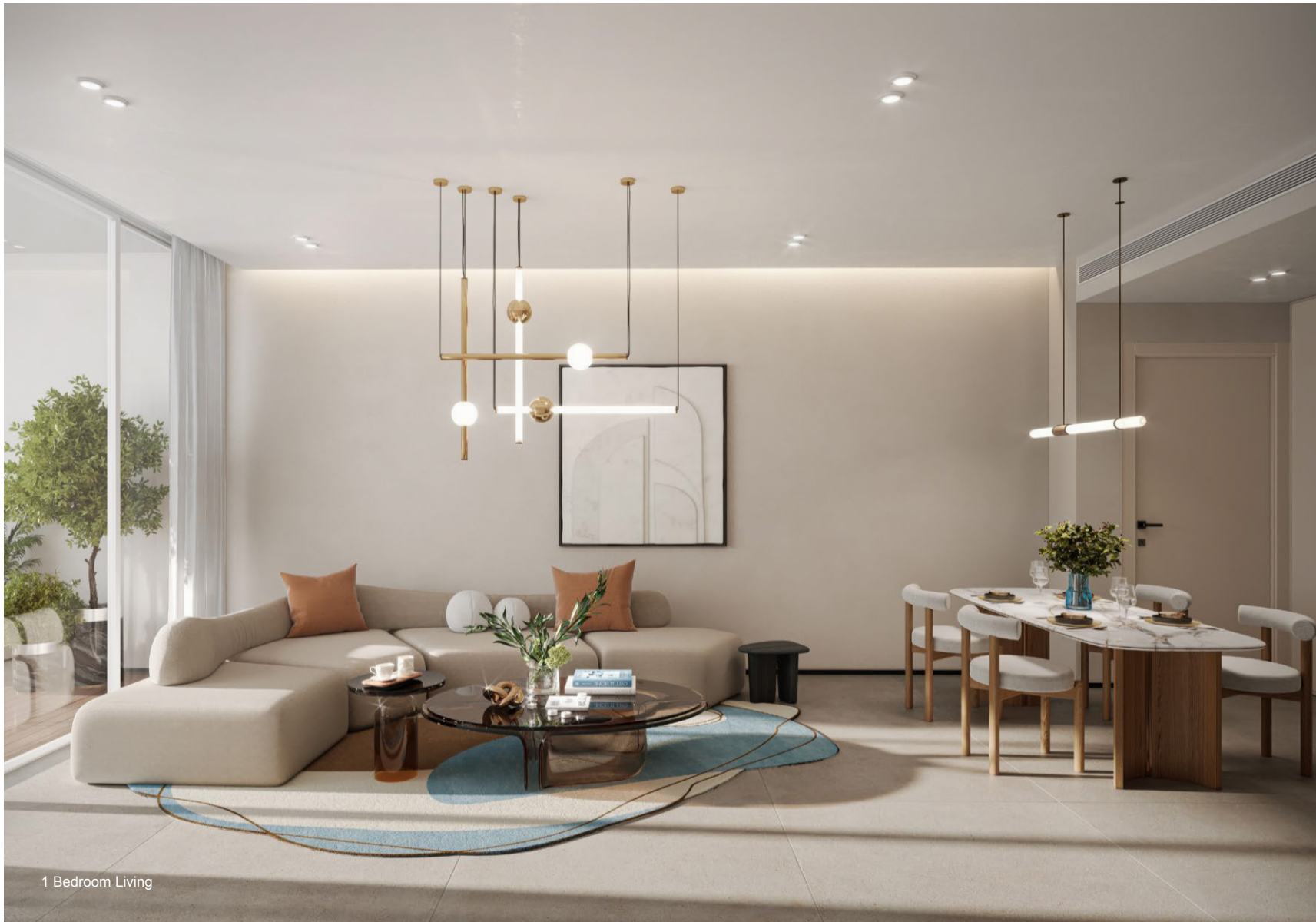
1 Bedroom Living