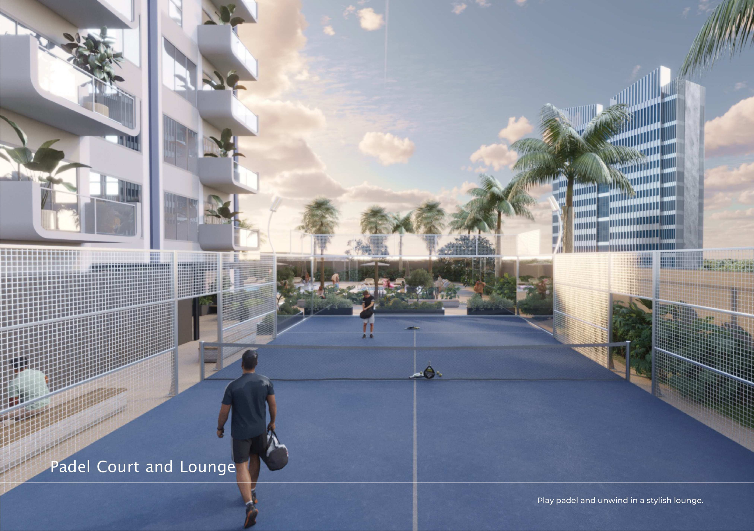
Padel Court and Lounge

Play padel and unwind in a stylish lounge.