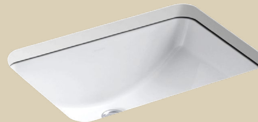
Bathroom under-mount sink