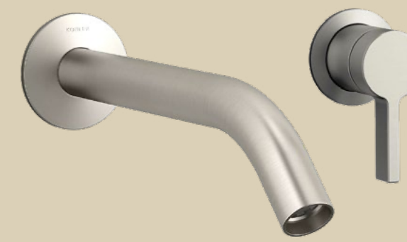
Wall mount spout and single control