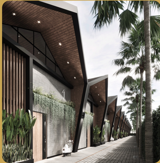
TOWNHOUSE 1 BDRM Building area | 75 m 2