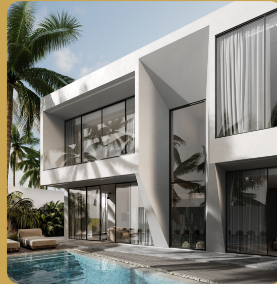
VILLA 3 BDRM Building area | 200 m 2