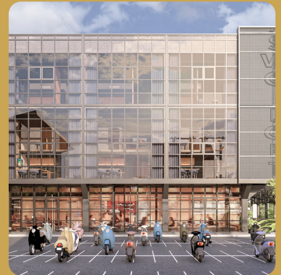
APARTMENTS 1 BDRM Area | 49-62 m 2