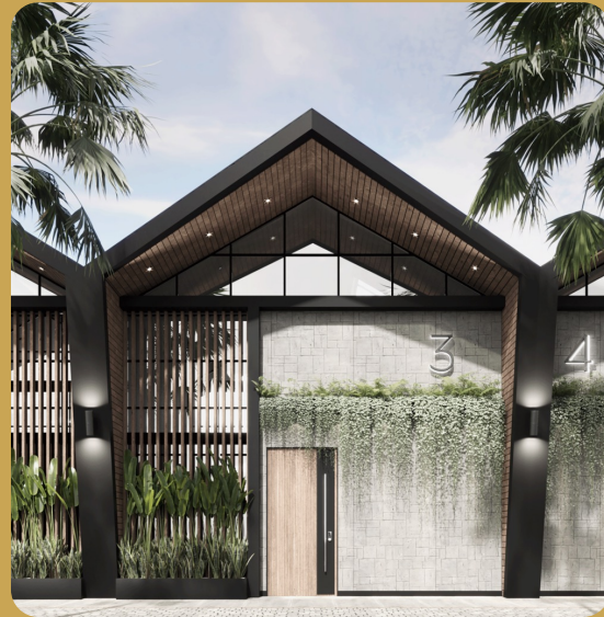
TOWNHOUSE 2 BDRM Building area | 105 m 2